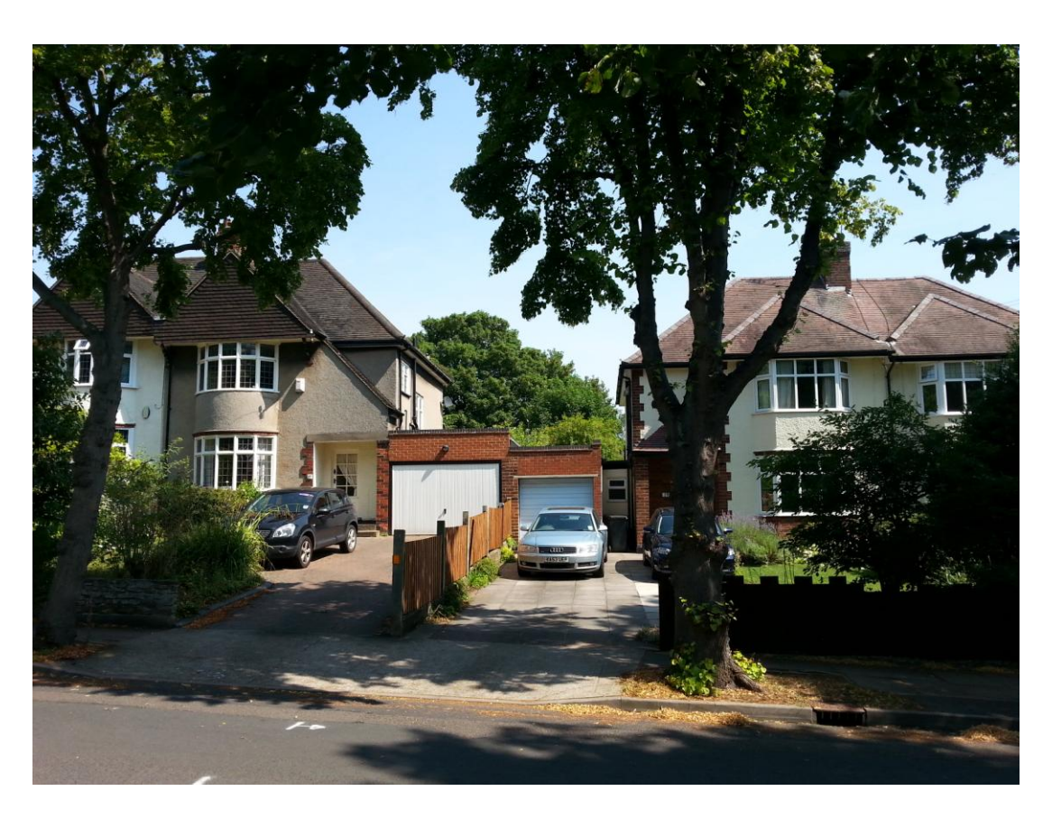
Photograph 4 from Hillcrest Ave between Nos. 17 & 19 (looking north east)